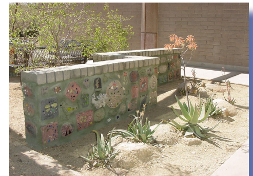
Desert plant and animal adaptations wall at the Xeriscape Demonstration Garden.

For more information on water conservation programs, please visit www.glendaleaz.com/waterconservation .