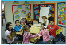
Glendale water history