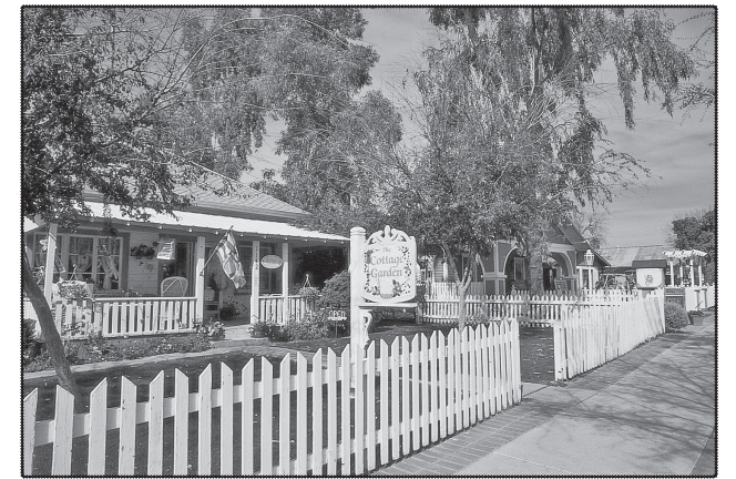
The Catlin Court Historic Home Tour will take place on Saturday, Nov. 8, from 10 a.m. to 4 p.m.

The Catlin Court Historic Home Tour will take place on Saturday, Nov. 8, from 10 a.m. to 4 p.m. This is only the second time Catlin Court homes have been opened to the public. The tour will feature eleven historic homes throughout Glendale's quaint, downtown community. Additional activities include free carriage rides and a vintage car show. Tickets are $10 in advance or $12 at the gate. For more information about the Catlin Court Historic Home Tour, visit www.catlincourthometour.com .