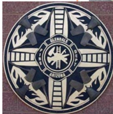
artwork: Fire Medallions Gregg LeFevre 2006, bronze Fire Station # 159