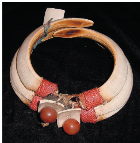
Warrior necklet, Ao tribe Shell, carnelian and boar's tusk wrapped