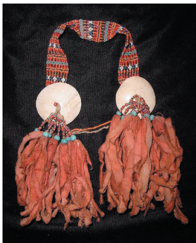
Earrings, Konyak tribe Shell, glass beads and dyed fabric strips