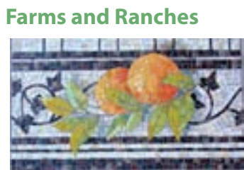
Farms and Ranches