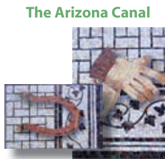
The Arizona Canal