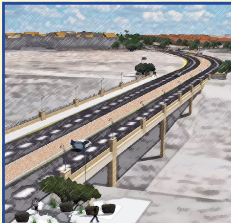
Rendering of the Beardsley connector at New River

The project will include the extension of Beardsley Road across New River to a new frontage road along Loop 101. As part of the project, Union Hills will also be widened at the traffic interchange. In addition, Beardsley Road will be widened between 83 rd and 81 st Avenues; Lake Pleasant Parkway will be widened north of Beardsley; and a raised median will be constructed on 83 rd Avenue south of Beardsley.