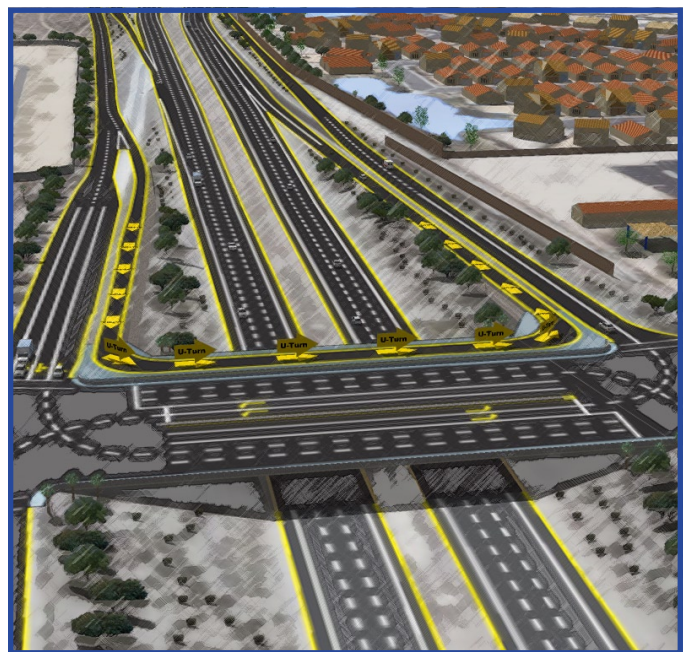
Rendering of the U-Turn ramp at Union Hills, looking north.