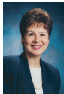
Mayor Elaine Scruggs

For a campus map, or more information about Thunderbird, go to www.thunderbird.edu