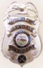
Promoted 2 Battalion Chiefs