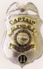
Promoted 9 Captains